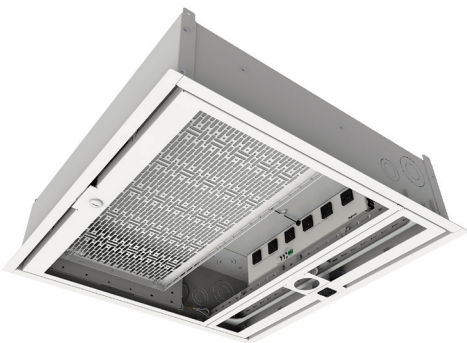
ECB2SP ECB2SP-CR ECB2SP-RLNK

For a new way to hide clutter, look up to the new Evolution Series Ceiling Boxes. They offer localized mounting for A/V and technology equipment in a plenum-approved enclosure. These boxes are available with and without an option for mounting a projector. Perfect for smaller spaces like conference rooms and education facilities where traditional racks and credenzas won't fit.