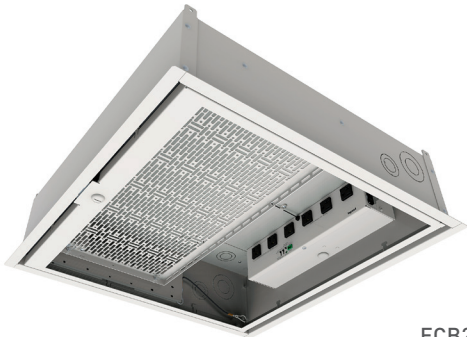
ECB2S ECB2S-CR ECB2S-RLNK